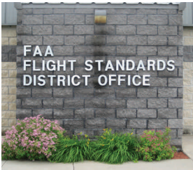
DSM FSDO to close October 20-30, 2014. Please schedule your aviation business accordingly.

The Des Moines FSDO will be closed for mandatory office training October 20-30, 2014. The Flight Standards Office will be training on the upcoming implementation of the Safety Assurance System also known as SAS. SAS is a new tool the FAA will be using to identify