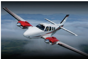
Safety is more than just no accident.