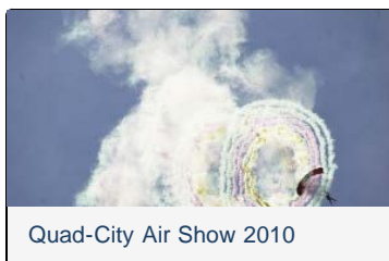
Quad-City Air Show 2010