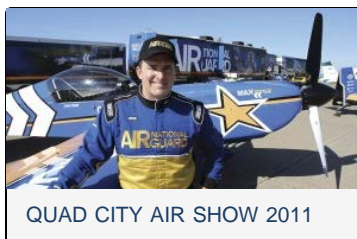
QUAD CITY AIR SHOW 2011