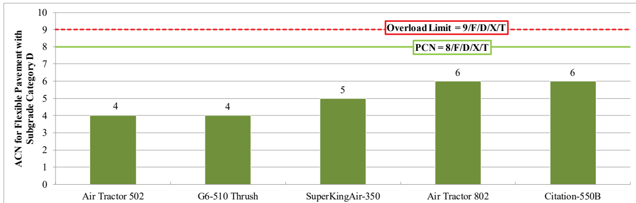
Figure 1. ACN–PCN comparison for Runway 15-33.

The discussion presented herein is based on a straightforward comparison between ACNs (for the aircraft at their analyzed weights) and PCNs for each pavement section. The ICAO overload guidance, included in the ACN–PCN Overview chapter of this report, can be referenced for aircraft with an ACN that exceeds the PCN for a specified pavement. Alternatively, aircraft with ACNs greater than the PCNs for analyzed facilities may be able to safely use these pavements, following the ACN–PCN procedure, by operating at a reduced weight.