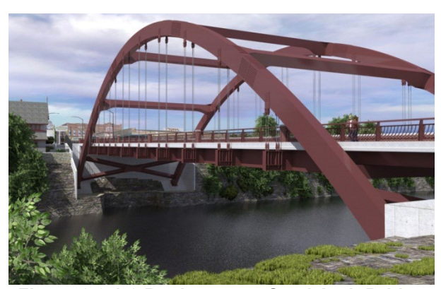
Figure 2.3.1-2 Replacement Steel Arch Bridge