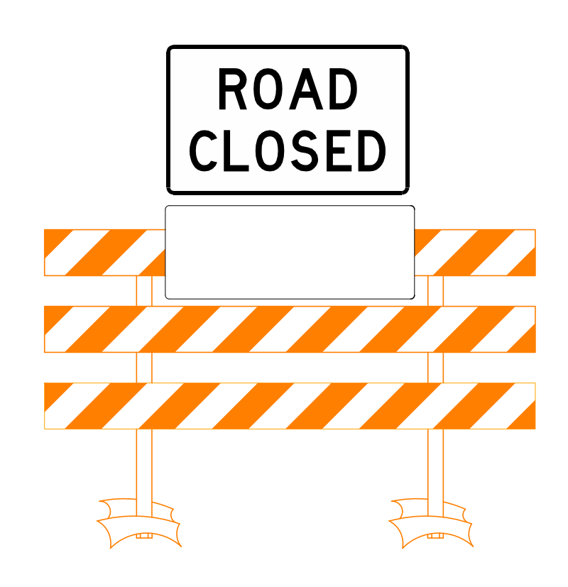
Sign Placement with Supplemental Sign

Possible Contract Items: Traffic Control Safety Closures Portable Dynamic Message Sign