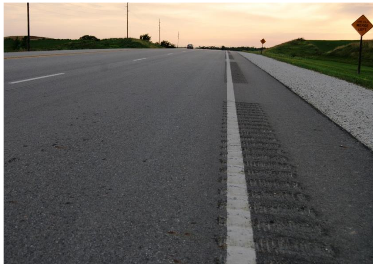
Figure 2: Rumble stripes.

Rumble stripes are rumble strips that have pavement markings placed over them after milling. Figure 2 is a photograph of a rumble stripe.