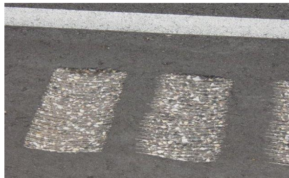
Figure 1: Rumble strips.

Milled rumble strips (or just "rumble strips") are transverse grooves milled into a pavement surface. See Standard Road Plans PV-12 and PV-13 for details. The noise and vibration that results from vehicles crossing over them alerts drivers that corrective action may be needed. Figure 1 is a photograph of a rumble strip.