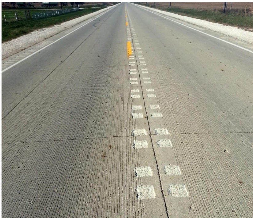
Figure 4: Centerline rumble strip pattern.

Centerline rumble strips (see Standard Road Plan PV-13 ) have demonstrated the ability to reduce multi-vehicle cross centerline crashes and single vehicle run-off-road left crashes. Rumble strips placed along the centerline are in line with the centerline pavement markings, so they become rumble strips. Figure 4 is a photograph of centerline rumble strips.