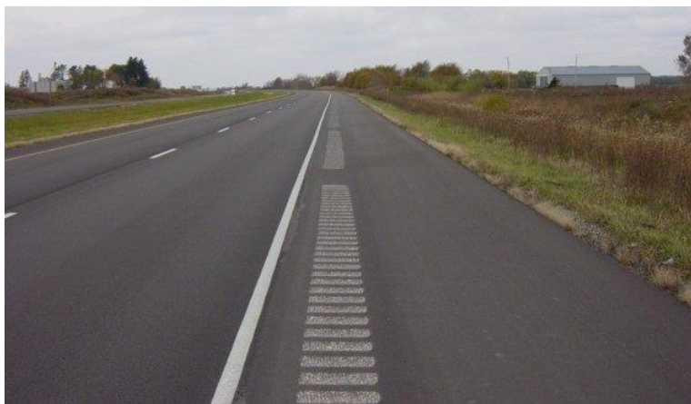
Figure 3: Gapped shoulder rumble strip pattern.

On highways where bicyclists are legally allowed, a gapped rumble strip pattern consisting of 48 feet of rumble strips followed by a 12 foot gap will be provided to allow cyclists to cross over, see Standard Road Plan PV-12 . Figure 3 is a photograph of a gapped shoulder rumble strip.