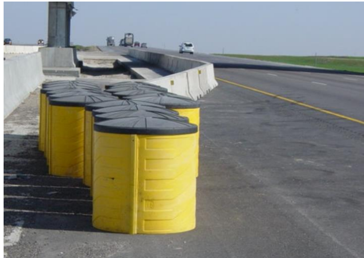
Figure 2: Sand filled barrel arrays are adaptable to many types of obstacles.

For design purposes, assume that a non-redirective crash cushion is equivalent to a sand filled barrel array. Sand filled barrel arrays can be installed either on pavement or on a dirt pad. If a barrel array will be located behind a curb, the curb must be ground to a 4 inch sloped curb adjacent to, and for 50 feet in advance of, the barrel array. If the barrel array will be located fully or partially off existing pavement, provide a graded dirt pad as shown on Standard Road Plan BA-500 .