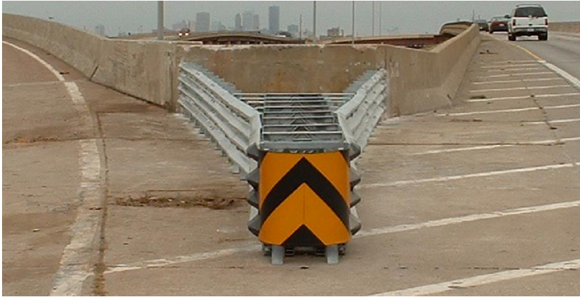
Figure 5: A crash cushion shielding a gore area.

For the crash cushion in shown Figure 5, the ends of the concrete barriers were located approximately 10 feet apart, so the contractor was required to install a wide crash cushion to protect this entire width. This added significantly to the cost of the crash cushion and makes repairs more difficult. Therefore, whenever possible, extend existing or proposed barriers closer together so that a standard width crash cushion can be used. The most preferable condition is to bring the barriers together and transition to a 24 inch wide, 30 inch long, vertical faced block. Contact the Methods Section for details.