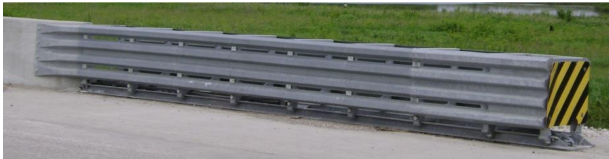
Figure 1: A typical crash cushion.

Crash cushions are used within the clear zone of approaching traffic where an obstacle exists that cannot be moved, made breakaway, or otherwise protected with a longer barrier. They are designed to dissipate the energy of a vehicle either partially during a side impact or fully in the case of a head-on impact. Obstacles that are commonly shielded with crash cushions include bridge rail end sections, temporary barrier rail (TBR) ends, and concrete barrier ends.