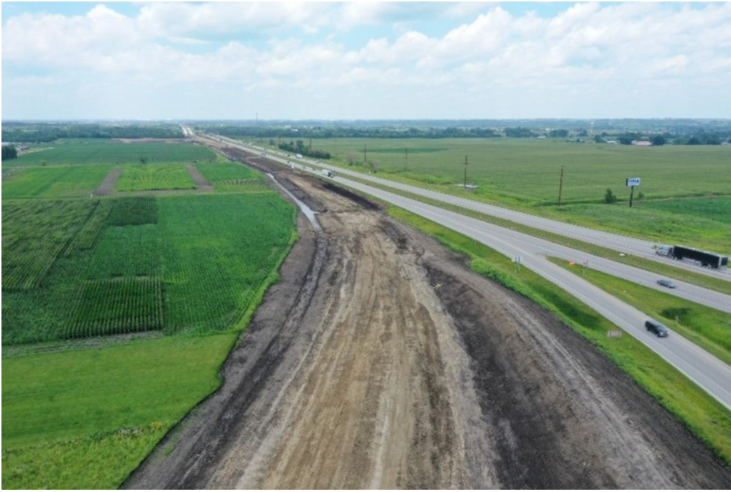
Looking north at I-35 from the IA 210 interchange