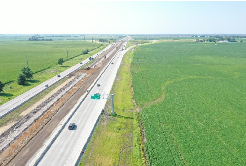
Looking south at the new Elkhart/NE 126th Interchange