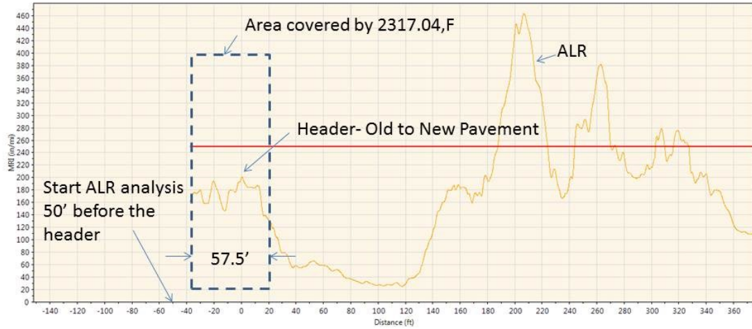
Figure 1. Area of Localized Roughness (ALR) Analysis at the Beginning of Project (Same at End of Project)

Note: The ALR at any point covers profile 12.5' back and 12.5' forward.